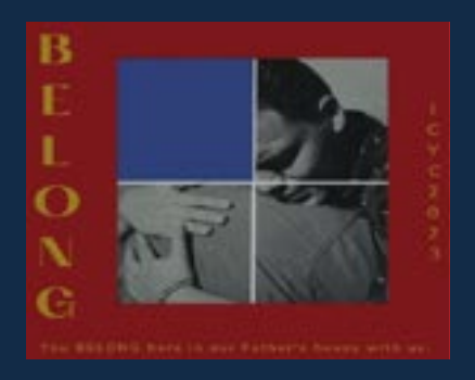
The Idaho Catholic Youth Conference is March 10th-12th. Come stop by our booth!