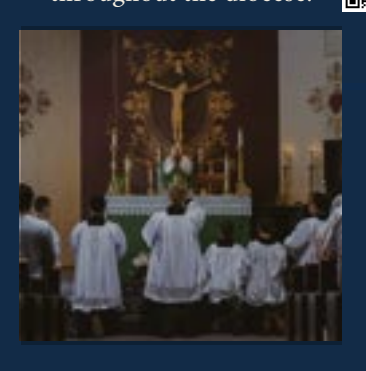
Join us for Mass at St. Paul's Sat Vigil - 5:15 pm Sun - 11:00 am Mon, Tues, Thurs, Fri - 5:15 pm Wed - 8:00 pm